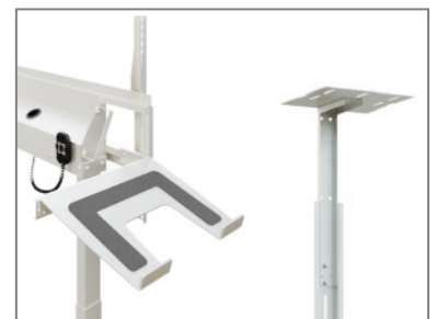
Extendable with laptop / camera holder