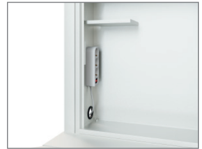
Lockable media cabinet